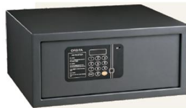
Safe For Hotel