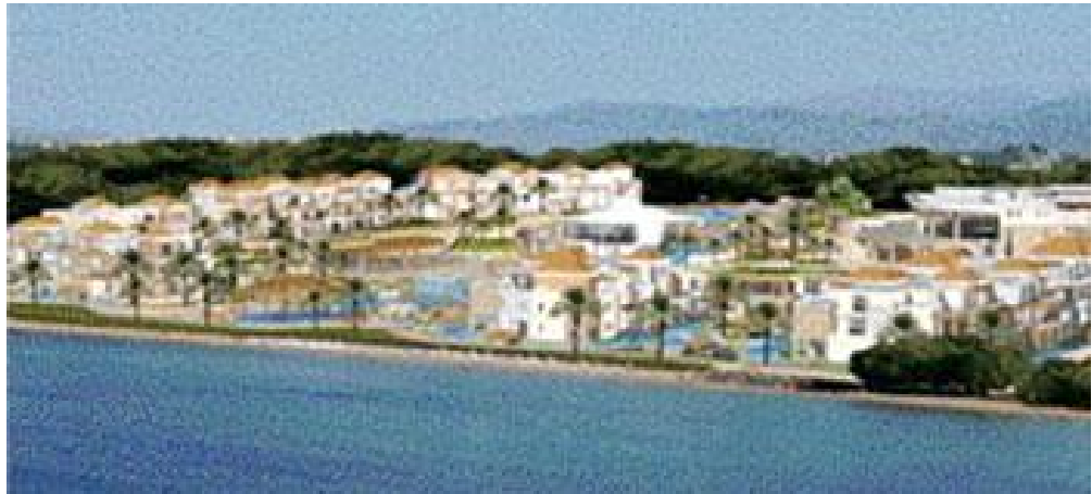
Atlantica Cadera Palace, Greece 430 rooms