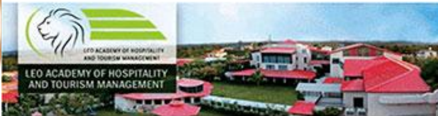
Leonia resorts, India, 100 rooms