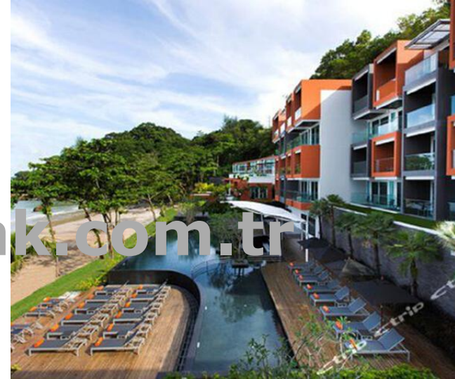
Novotel Comcala Beach, Phuket, thailand 180 rooms