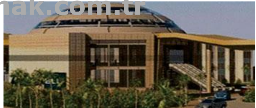
Raddison Blu Zambia