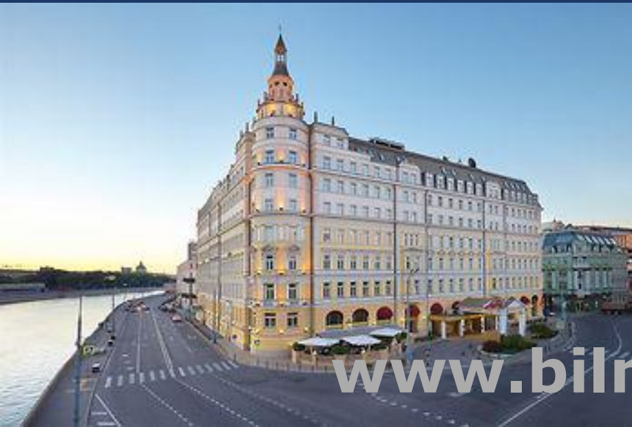
Kempinski Mosco 340 rooms