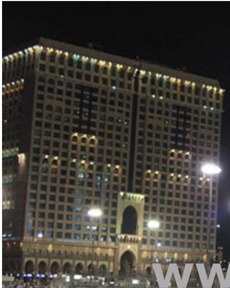
Al-Safwa Hotel, Saudi Arabia